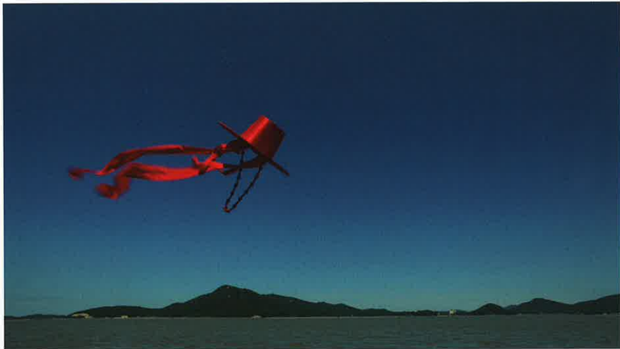
Manshin: Ten Thousand Spirits (still), 2014, HD video, 104 min