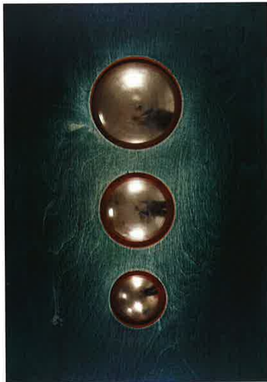
top Way to the Seung-ga Temple (detail), 2017, multichannel slide projection in loop and installation, dimensions variable