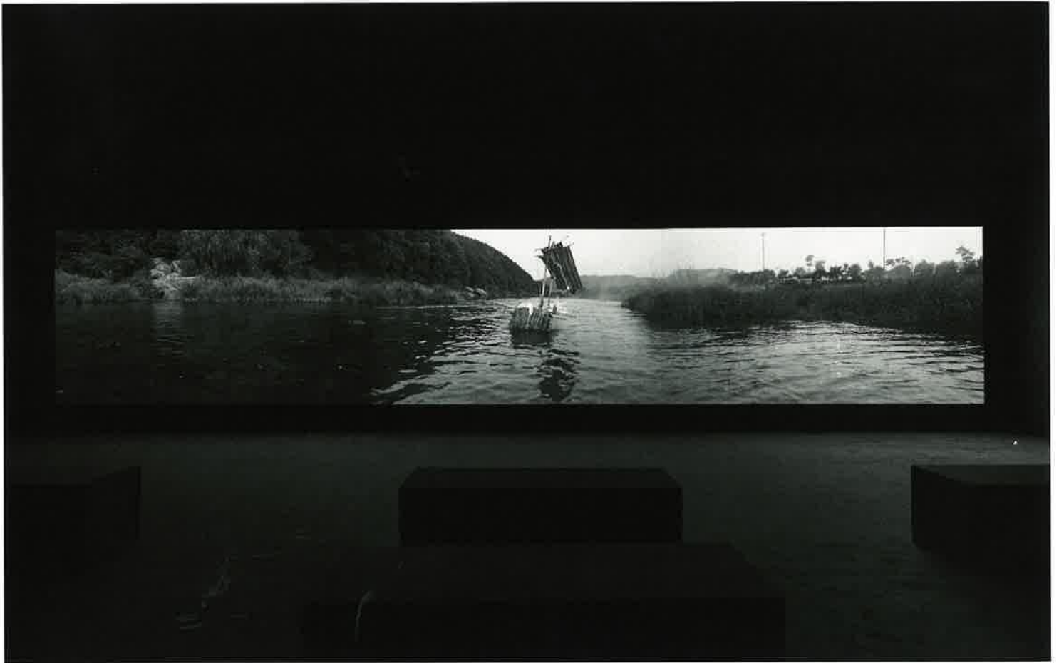
above and facing page Citizen's Forest (details), 2016, three-channel video, b/w, ambisonic 3D sound, 26 min 6 sec