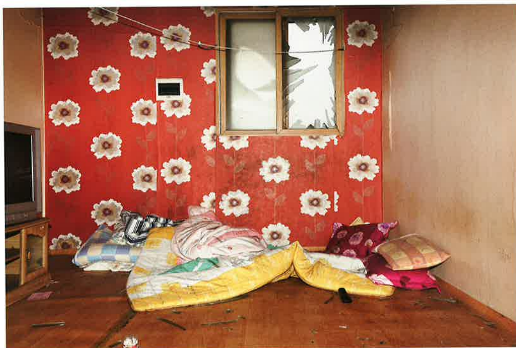
page 89 Noh Suntag, In Search of Lost Thermos Bottles (detail), 2010, inkjet pigment print, dimensions variable.