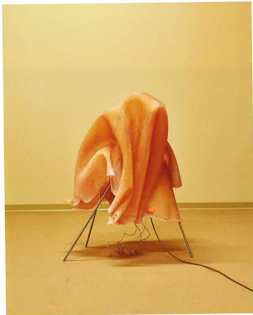
page 64 Anicka Yi, Escape From The Shade 1 , 2016, epoxy resin, stainless steel, lightbulbs, digital clock interface, wire, 177 × 62 × 59 cm.