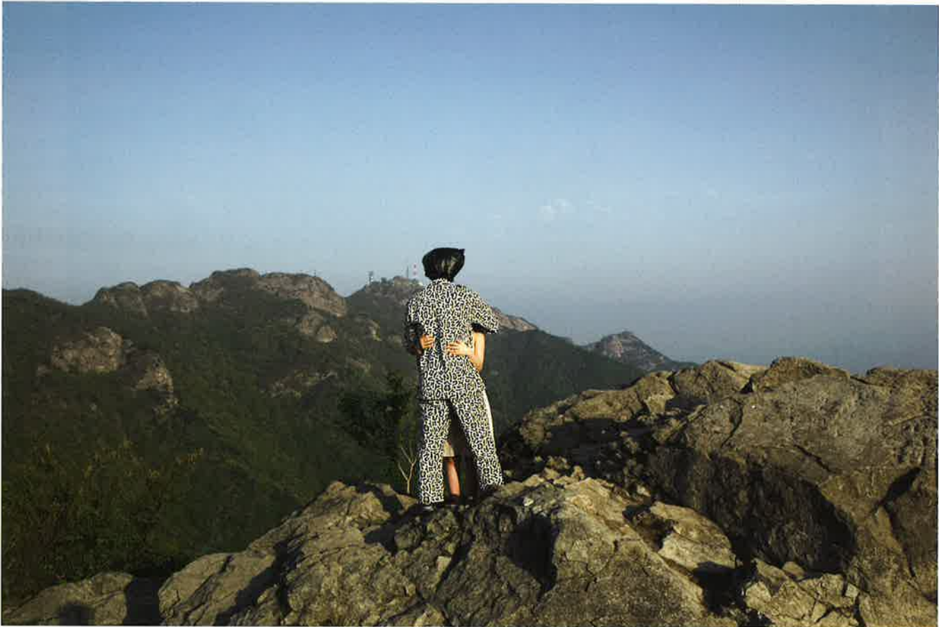
Sindoan (detail), 2008, mixed-media installation